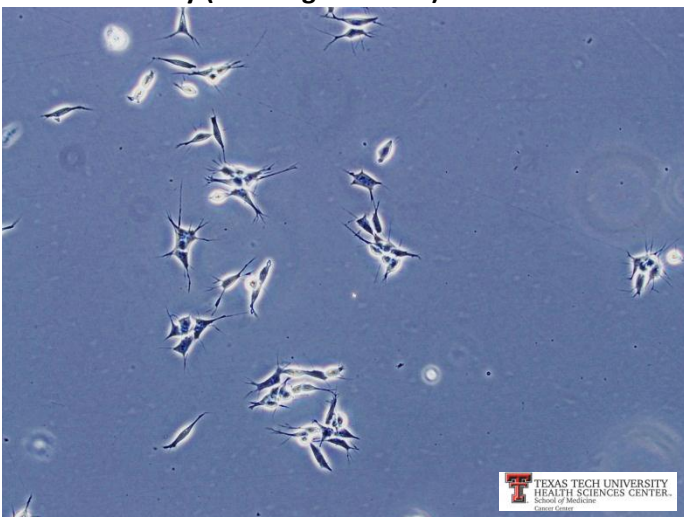
Low confluency (20x magnification)